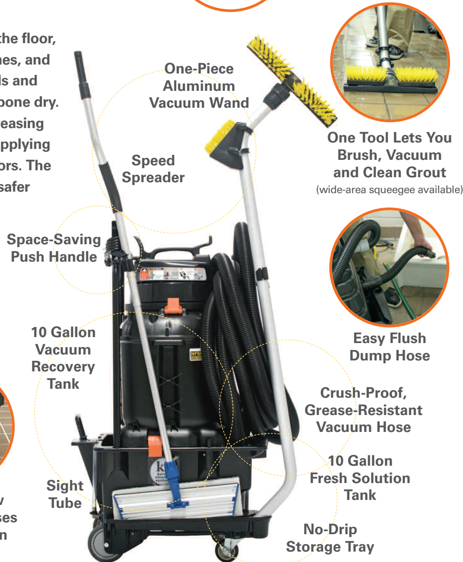
One-Piece Aluminum Vacuum Wand