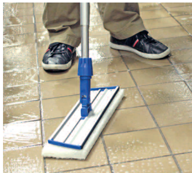
Rapidly spread solution across floor with the Ergo Speed Spreader.