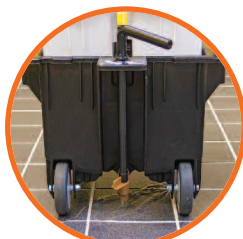
Variable Flow Spigot Dispenses Fresh Solution

Kitchen Cleaning and Degreasing Restroom Floors Grouted Floors Entrance Ways Spill Pick-up Flood Pick-up Floor Stripping