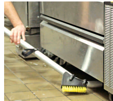
Vacuum under fixtures, shelves and seating with the versatile vac wand.